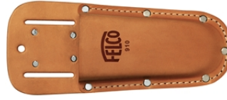
FELCO 910 Holster Leather - With belt loop and clip