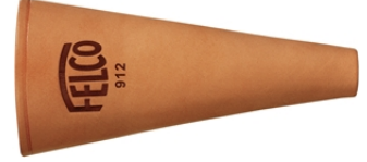
FELCO 912 Holster Leather - With belt clip